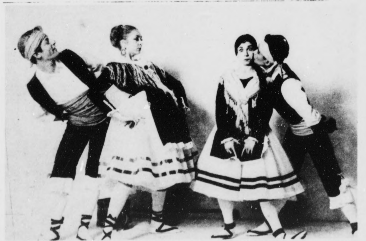
Physical dexterity requiring technical brilliance is displayed by members of the Theatre Flamenco as they perform Jota